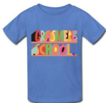
Made to Order Younger Kids T-shirt (2-8)

Our FROGS shop is now open, and you can order your Disco and Santa's grotto tickets, your Christmas tree, as well a whole range of made-to-measure Grasmere tops, including T-shirts and hoodies (for kids but also for adults!). Here's the link to the shop: https://www.friendsofgrasmere.com/shop .