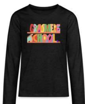
Made to Order Older Kids Long-Sleeved Top (10-12)