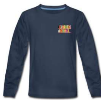
Made to Order Younger Kids Long-Sleeved Top (2-8)