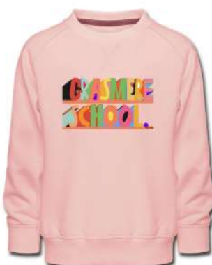
Made to Order Kids Crewneck Sweater (3-14)