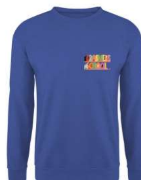
Made to Order Adult Crewneck Sweater