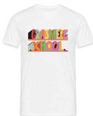
Made to Order Men's T-Shirt