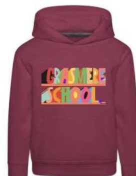
Made to Order Hoodie (3-14)