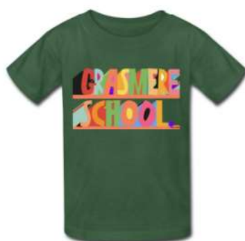
Made to Order Older Kids T-shirt (8-12)