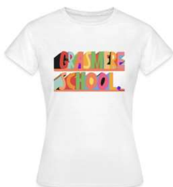
Made to Order Women's T-Shirt