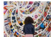
Experiences and Community @ LEAP