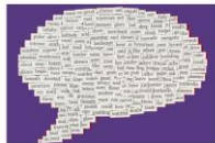
Language @ LEAP The language we use with our children, in our classrooms and playgrounds shapes the way they see the world and how they think and act. ©2016 LEAP Education Services