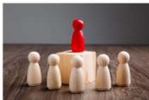
Leadership, Development and Evaluation @ LEAP Leadership is an action, not a position.