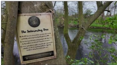
A Talking Tree Collective mystery sign

This lovely informal art trail features small signs nestled among the trees—each one revealing the imagined inner thoughts and secret lives of the woodland. Word spread and her creation was covered first by the Hackney Citizen newspaper and then by BBC local news!